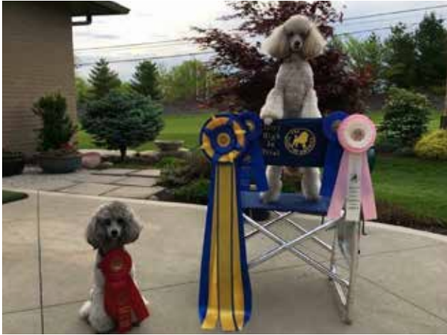
Baby “True” with sister HIT “Bliss” in her winners chair