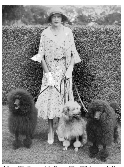
In July, the club Poli, Blue Riband and Nymphaea Jasper, its Newport, August 1931.

membership to the American Kennel Club, and the application was approved by AKC on August 11<sup>th</sup>. The Poodle Club of America was then "official," and its members began to plan the Club's first specialty show for June 11, 1932.