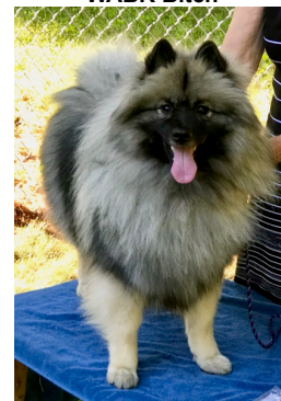
GCH CH Windrift's Dream Girl Want to see your dog here?