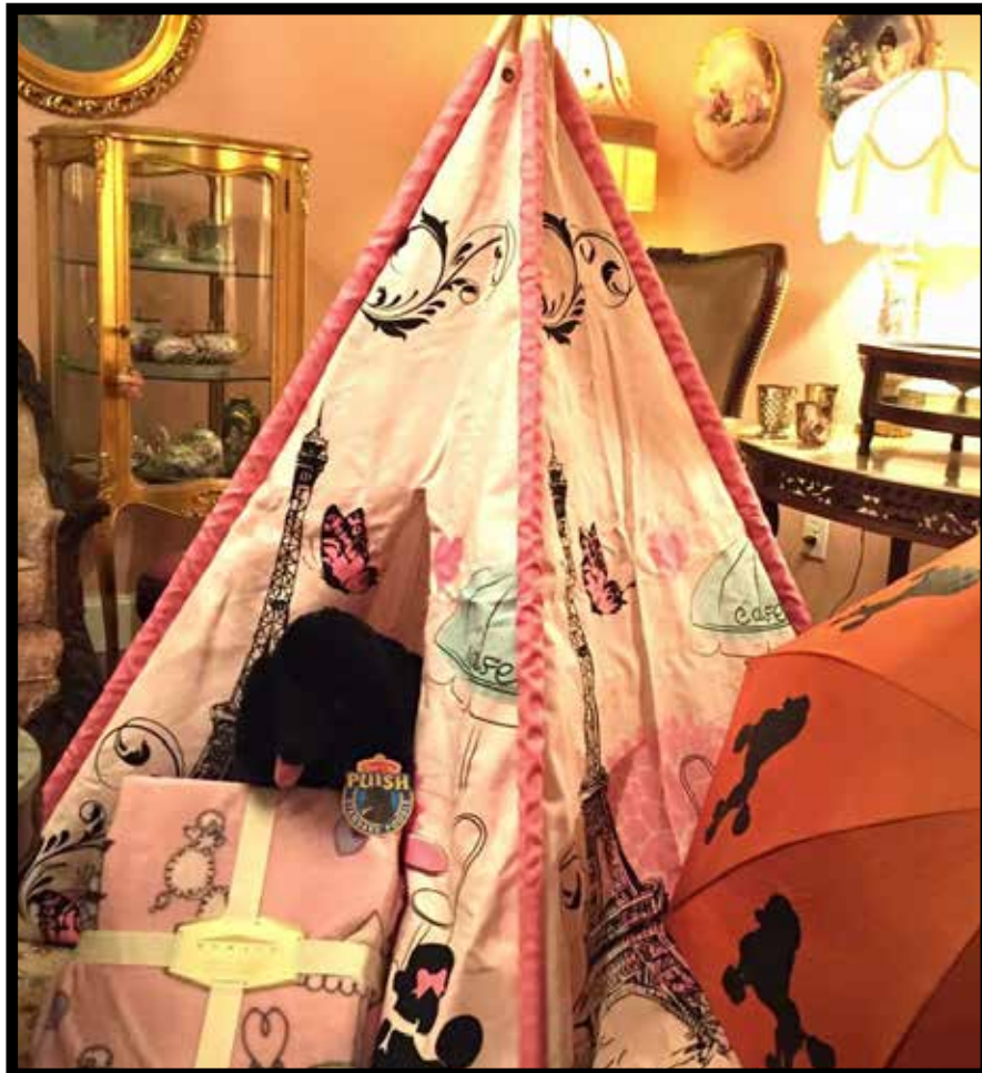
The Poodle Papers