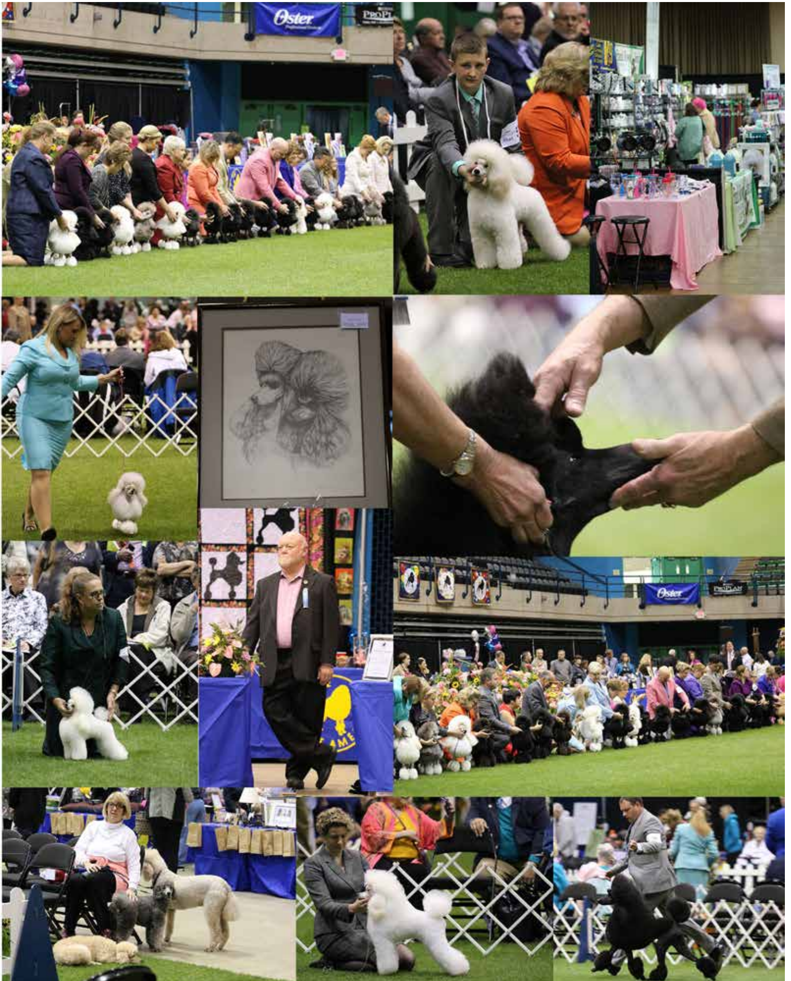
The Poodle Papers