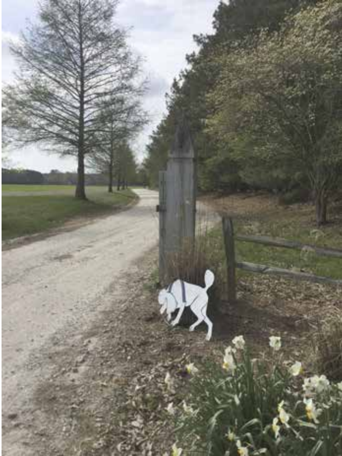
Entrance to Tracking Tests at Pemberton Park, Salisbury, MD

I've got good news, bad news, and great news!