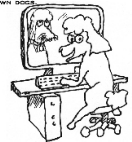
"I found my great-great-grandad!

TOY & MINI POODLE DATABASE OF 92,000 DOGS RUNS ON THE BAME COMPUTER OPERATING SYSTEMS.