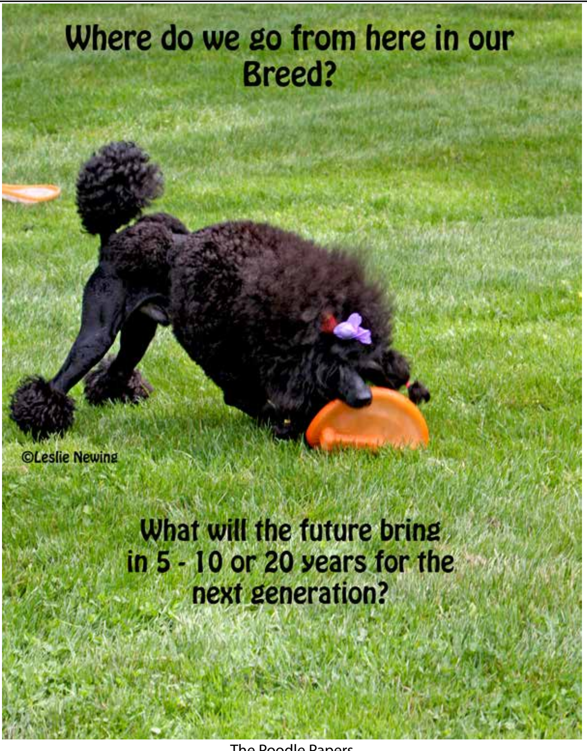
The Poodle Papers