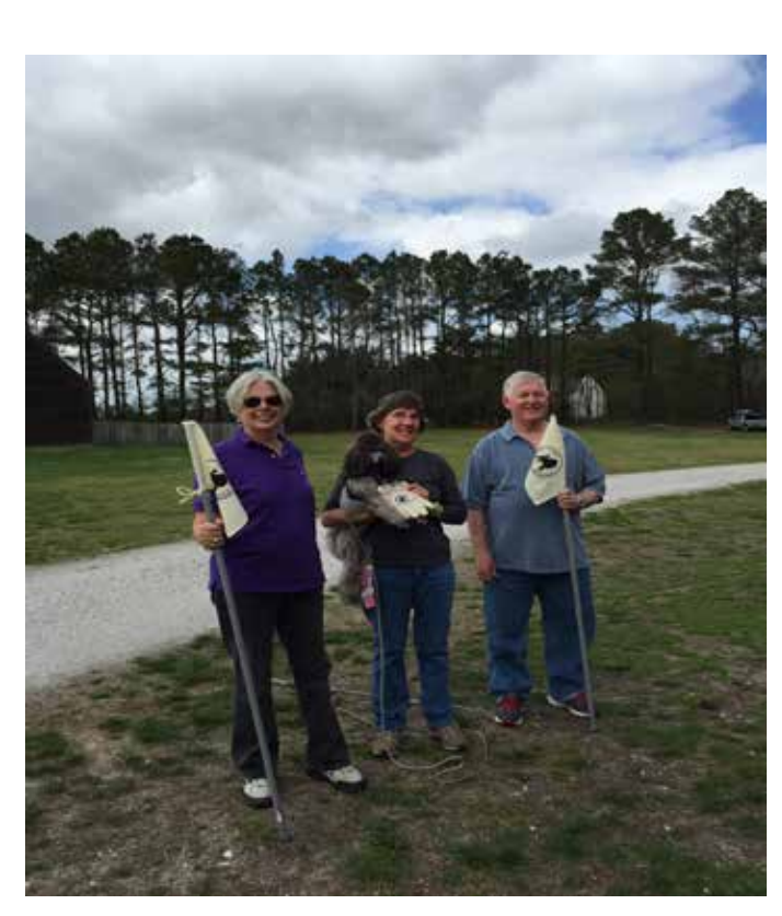
The Poodle Papers