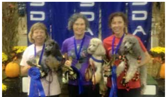
The Poodle Papers