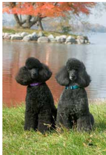
“TY and T “