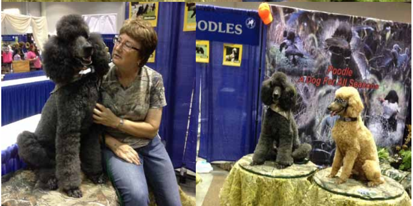
The Poodle Papers