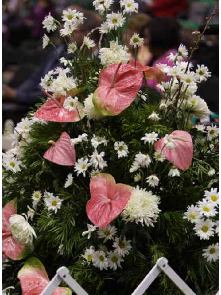
Flowers at PCA 2014, as always a wonderful sight!

Please email me at pcanewsletter@yahoo.com if you have a Poodle fancier that has passed away that you would like to include in the Newsletter that has been an active member of the breed, that we love so much.