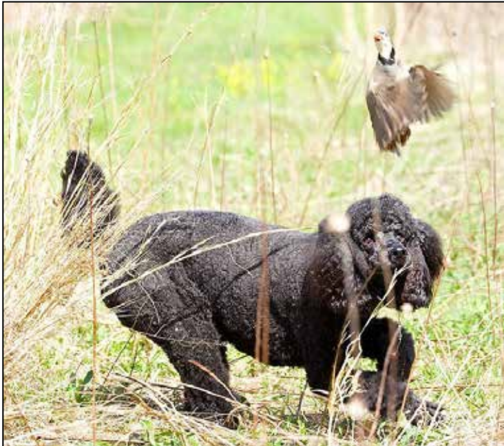
(Ghillie putting up a bird)