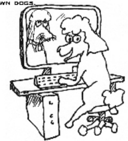
"I found my great-great-grandad!"

TOY & MINI POODLE DATABASE OF 92,000 DOGS RUNS ON THE SAME COMPUTER OPERATING SYSTEMS.