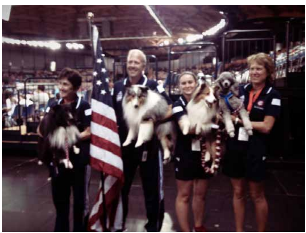
The Poodle Papers